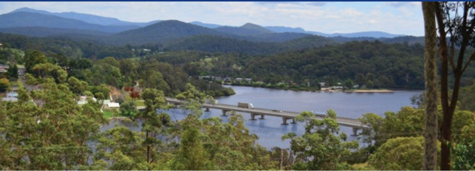
View of the proposed bridge from the east

The Nelligen Bridge project will replace the existing Nelligen Bridge with a new bridge upstream to ensure a safe and reliable crossing on the Clyde River, and to improve road safety and traffic efficiency on the Kings Highway. The NSW Government has provided $5 million in 2017/18 to finalise development for the project.