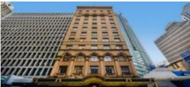
BOUTIQUE HOTEL CASTLEREAGH ST CITY