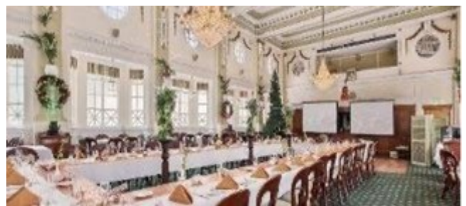
CELLOS ROOM 4 TH FLOOR.

THE CLUB'S FIRST BI-MONTHLY LUNCHEON FOR 2024 AND CLUB AGM WILL HELD AT THE BOUTIQUE HOTEL CITY WITH DETAILS: -