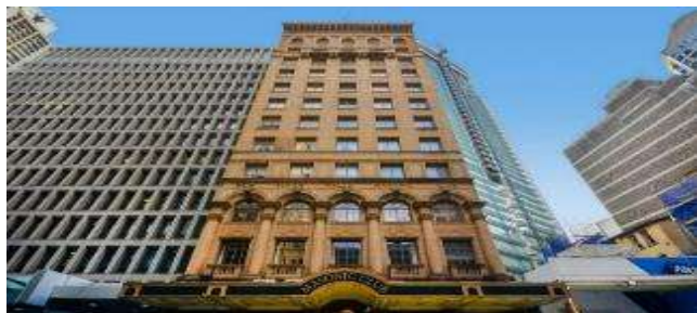
BOUTIQUE HOTEL CASTLEREAGH ST CITY