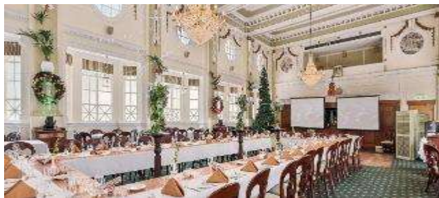
CELLOS ROOM 4 TH FLOOR.

THE CLUB'S 2 ND BI-MONTHLY LUNCHEON FOR 2023 WILL HELD AT THE BOUTIQUE HOTEL CITY WITH DETAILS: -