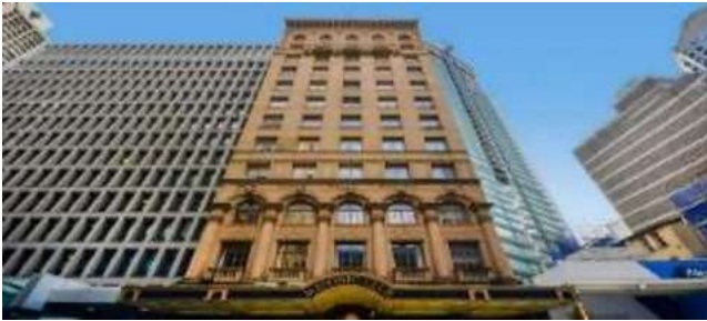
BOUTIQUE HOTEL CASTLEREAGH ST CITY