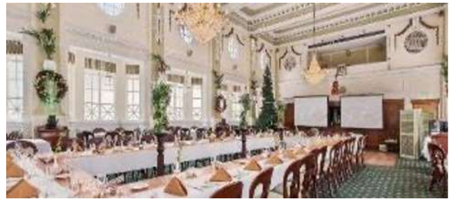
CELLOS ROOM 4 TH FLOOR.

THE CLUB'S 4 th BI-MONTHLY LUNCHEON FOR 2023 WILL HELD AT THE BOUTIQUE HOTEL CITY WITH DETAILS: -