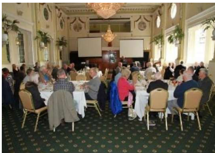
MEMBERS ENJOYING BI-MONTHLY LUNCHEON AT BOUTIQUE HOTEL 19 JUNE 2023