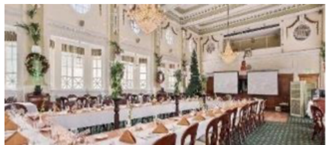
CELLOS ROOM 4 TH FLOOR.

THE CLUB'S FIRST BI-MONTHLY LUNCHEON FOR 2024 AND CLUB AGM WILL HELD AT THE BOUTIQUE HOTEL CITY WITH DETAILS: -