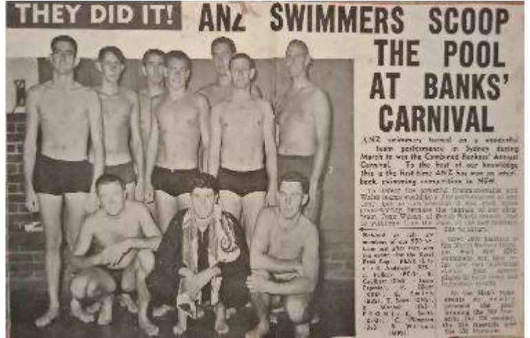
ANZ Swimming Club Newspaper article in early 1960/61 –

New Members. No new members since the last newsletter.