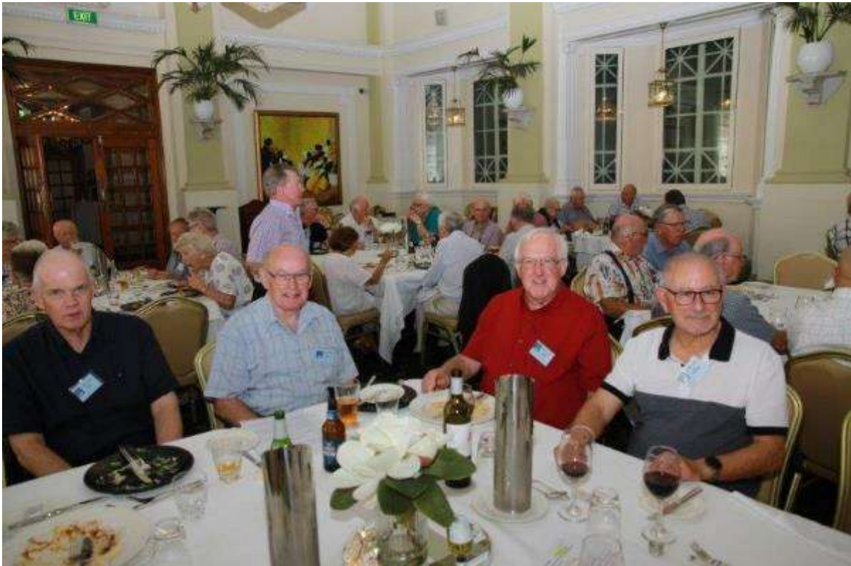
Members enjoying the AGM Luncheon at Boutique Hotel on 20 February 2023.

A full set of photos taken have been placed up on our web site for all to see with 3 in this NL.