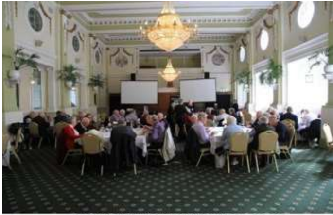
MEMBERS ENJOYING CLUB LUNCHEON IN CELLOS ROOM BOUTIQUE HOTEL CITY 21 AUGUST 2023.