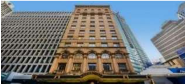
BOUTIQUE HOTEL CASTLEREAGH ST CITY