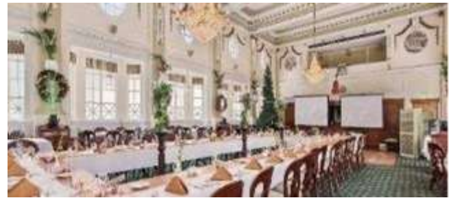
CELLOS ROOM 4 TH FLOOR.

THE CLUB'S 5 TH BI-MONTHLY LUNCHEON FOR 2023 WILL HELD AT THE BOUTIQUE HOTEL CITY WITH DETAILS: -