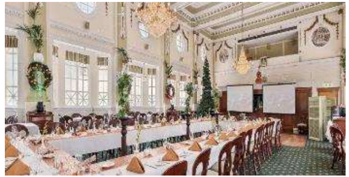
CELLOS ROOM 4 TH FLOOR.

WE ARE PLEASED TO INFORM MEMBERS THAT OUR NEXT BI-MONTHLY METRO LUNCHEON FOR 2022 WILL AGAIN BE HELD AT THE BOUTIQUE HOTEL CITY WITH DETAILS: -