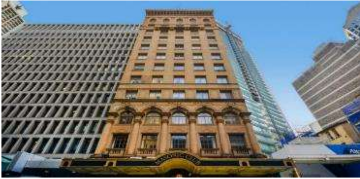
BOUTIQUE HOTEL CASTLEREAGH ST CITY